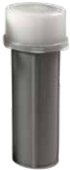
With PCS™ You KNOW Your Slush is Protected During Transport & Sterile During Procurements.