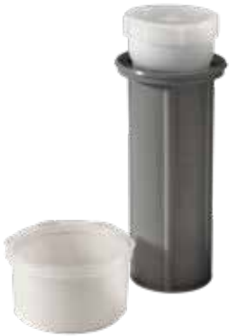
Reusable Slush Container inside Protective Container System™ with Locking, Tamper-Evident Cap.