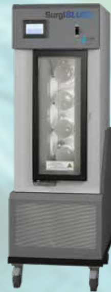
Automated 4-Liter Freezer