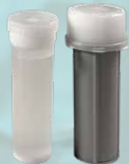
Protective Container System™